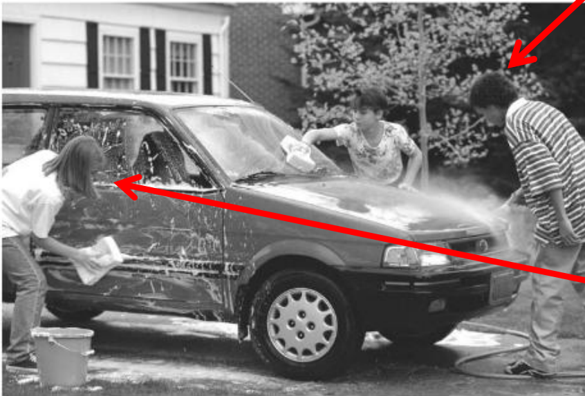
Car wash a success