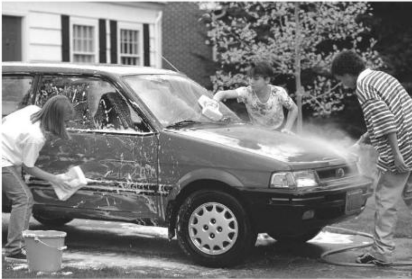
Car wash a success